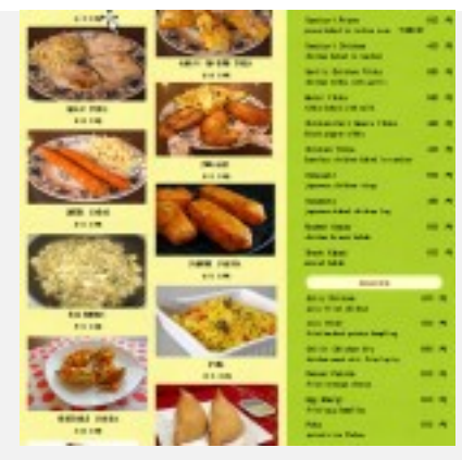
Menu - click to enlarge

How sweet is that?! On the topic of sweets, for dessert, we had a scrumptious carrot halwa and something called Shrikhand. It's apparently a specialty dessert from Mumbai, and is now one of my favorite desserts ever ! It's yogurt and saffron, delicately balanced and sinfully creamy. The texture is more like pudding than yogurt, with some raisins and almonds mixed in. So delicious, it nearly brought me to tears.