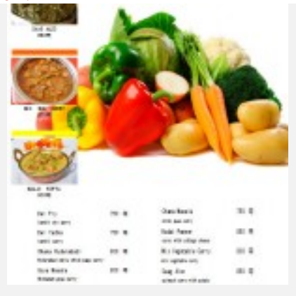
Menu – click to enlarge

Hours: 11:00 a.m. – 3:00 p.m. and 5:00 p.m. – 10:00 p.m. Closed on Wednesdays.